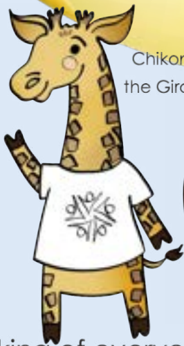
Chikondi the Giraffe